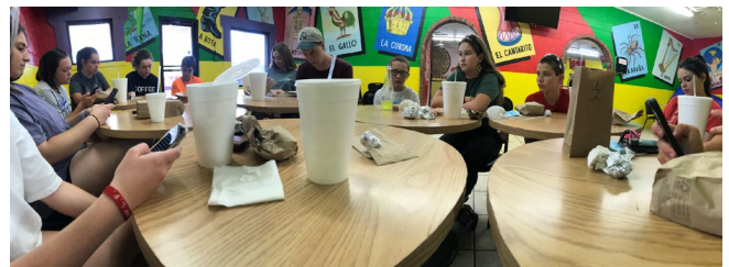
Breakfast Bible Study at La Popular.

~ Lake Day --Our next Lake Day will be on Tuesday, July 28 th . Drop off (8 A.M.) and pick up (5 P.M.) will be at the church building. Make sure to bring a water bottle and a sack lunch.