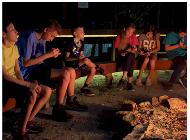
Campfire devo on the fall retreat.

Please pray for our students' well-being as they start this semester!