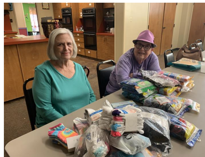
Thanks for all the socks and underwear donations for Bonham Elementary!