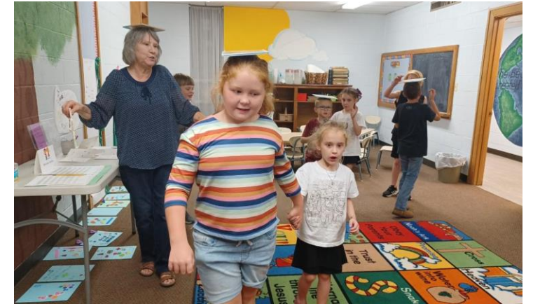
Partners focused on encouraging their friends rather than criticizing, remembering that God is judge, not us.

Please sign up to help with the infants to threes on Wednesday night. Thank you for choosing a Wednesday to supervise these young ones. Your help is appreciated.