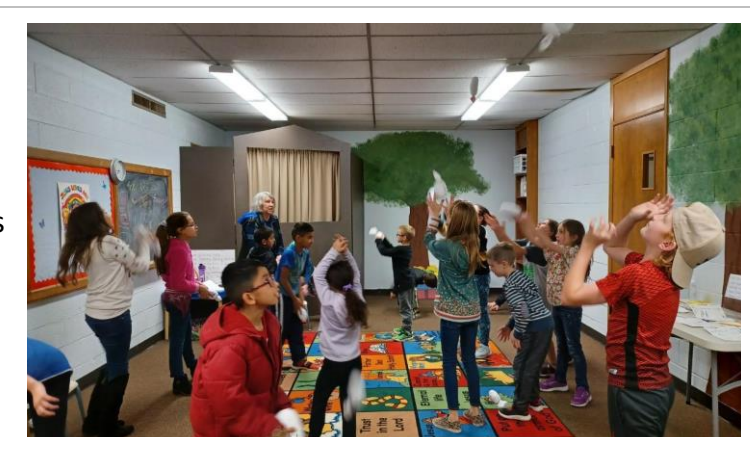
Wednesday night class made hail balls as the plagues were reviewed. This lively group enjoys learning together.

Please continue to pray for Westgate educators this week. "I am the light of the world. He who follows Me shall not walk in darkness, but have the light of life." John 8:12