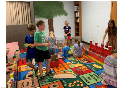
Children worked together to rebuild the wall around Jerusalem with a discussion of Nehemiah and God’s faithfulness. Building was intense, cooperation was evident, and smiles were prolific.

During this last week of school, please pray that our educators keep smiling and keep encouraging students: “Look to the LORD and His strength; seek His face always.” I Chronicles 16:11.