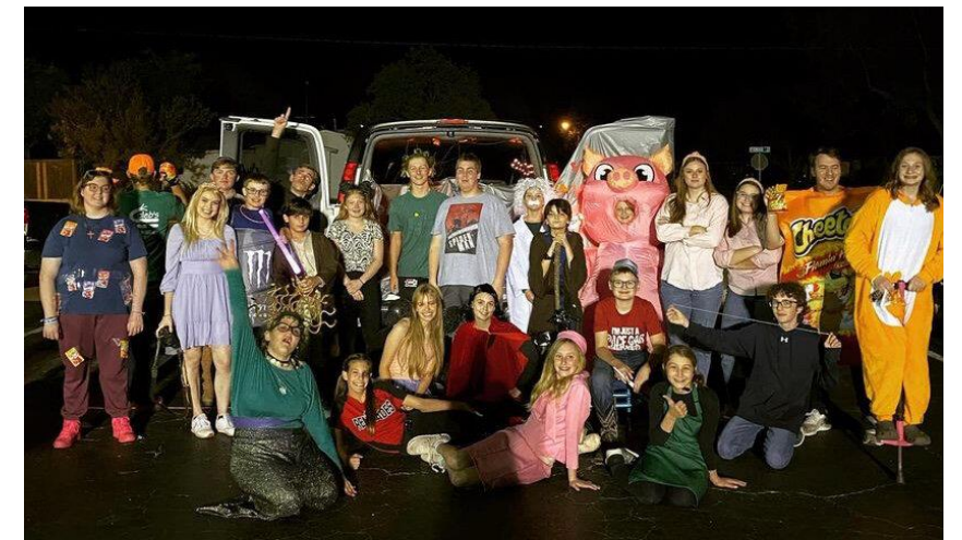
We had such a blast serving food and organizing games at Trunk or Treat!

Please pray for our students this school year!