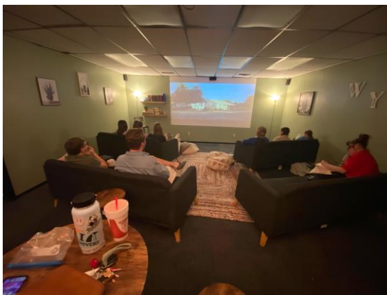
Movie Night in the Youth House!