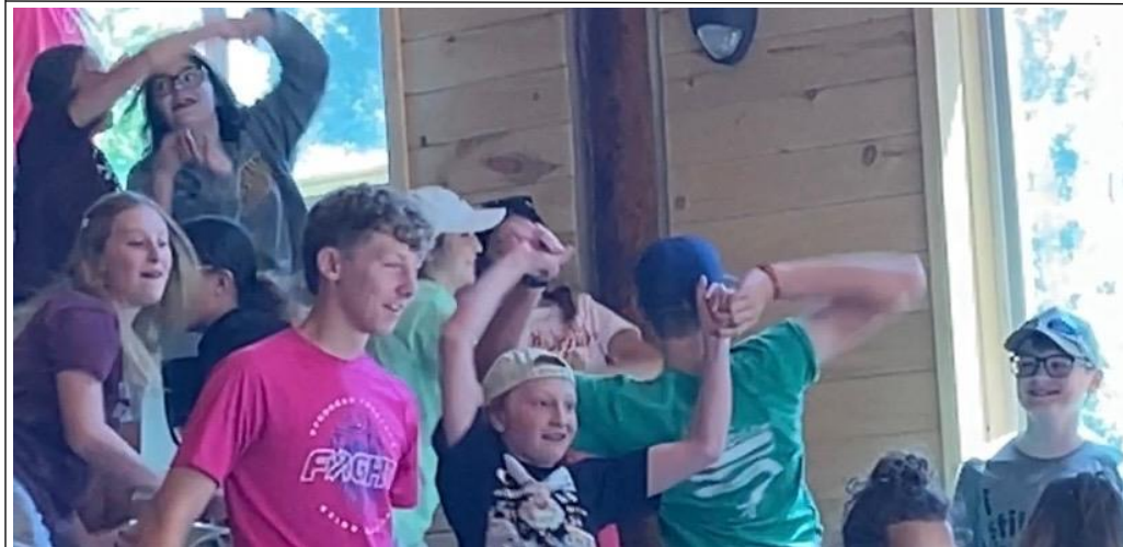
Our students at Pine Springs waking up at morning devo!

Join us for our next Lake Day on Tuesday, July 18 th !