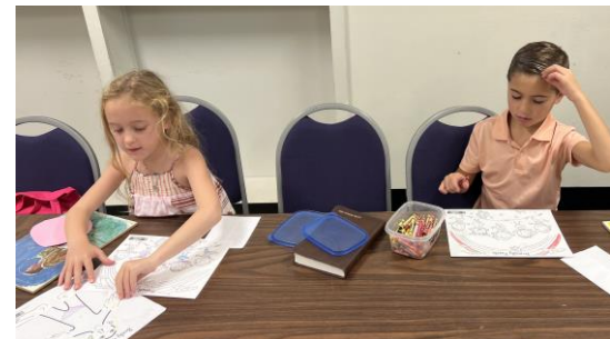
This new group of 2 nd and 3 rd graders worked on Promotion Sunday projects.