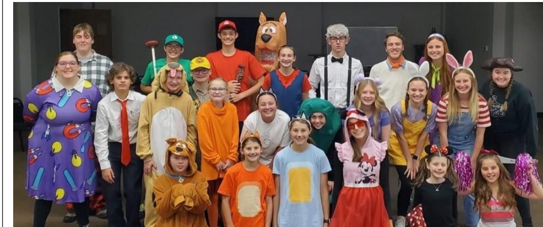
Everyone looked so stylish at our youth group costume party last Sunday! Thank you so much for all your hard work at Trunk or Treat too!