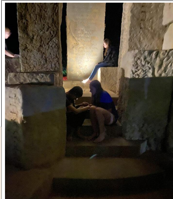
Students praying at our devotional at Jacob's Dream last Sunday!