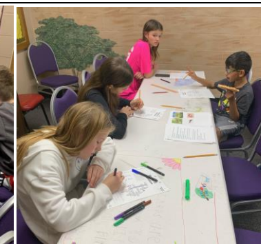
4 th and 5 th graders illustrated Proverbs 30. Please check out the mural in the hall and pat a few of the artists on the back.