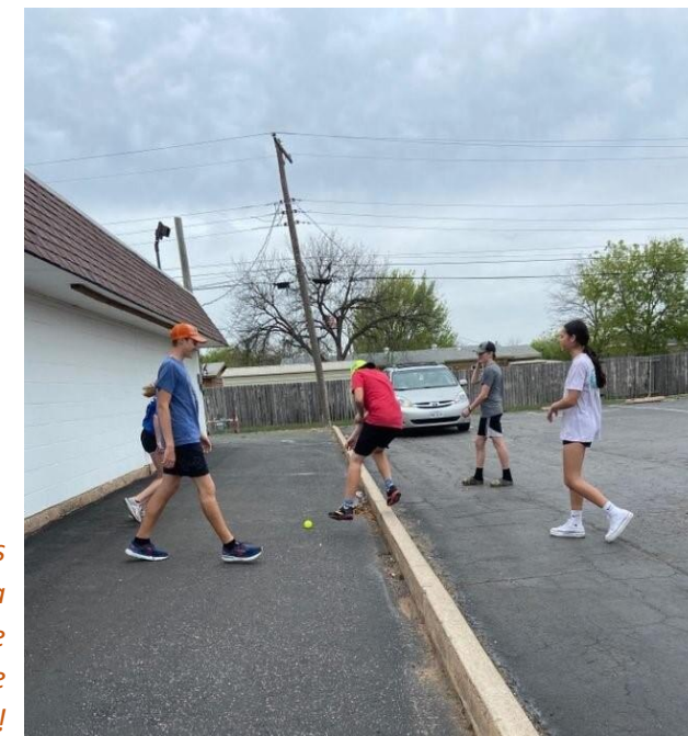
Youth Students playing a competitive game of Wall Ball outside the youth house!

Services at Westgate: Sundays—Bible Class 9:00 a.m., Worship 10:00 a.m., Wednesdays—Bible Class 6:45 p.m.