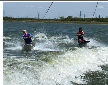
Lake Day earlier this summer