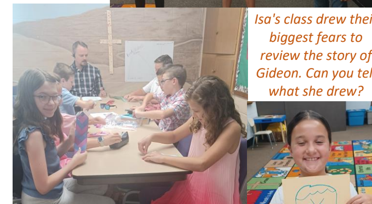
4th & 5th graders created Faithfulness Paper Braids while studying Ruth.