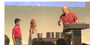
2023 First Grade Bibles